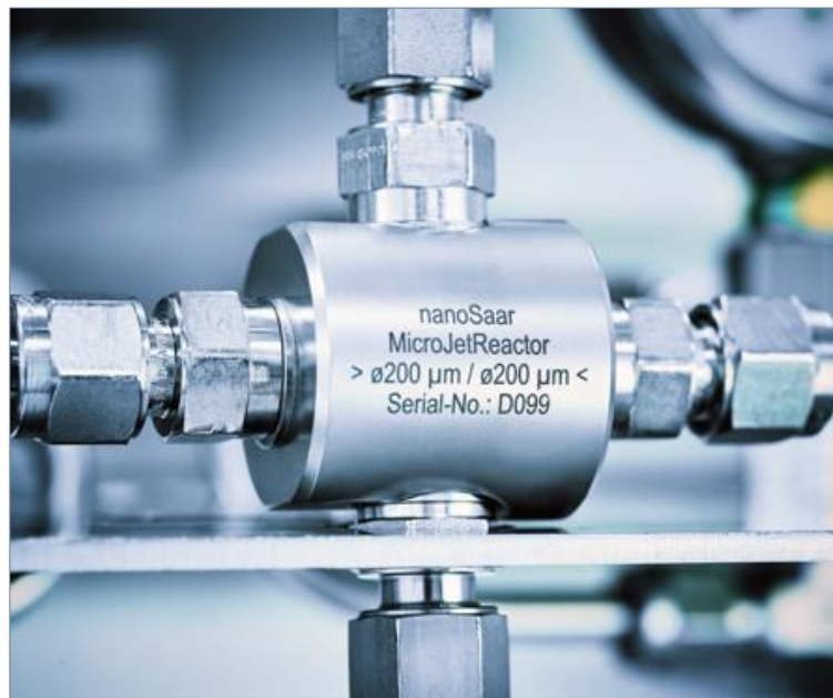
MicroJetReactor MJR ®